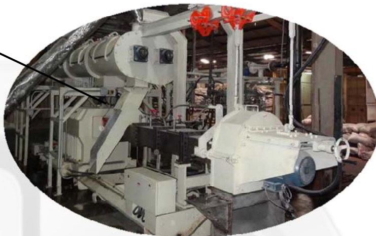
Photo courtesy of CP Prima Group the leading aqua feed manufacturer in Indonesia